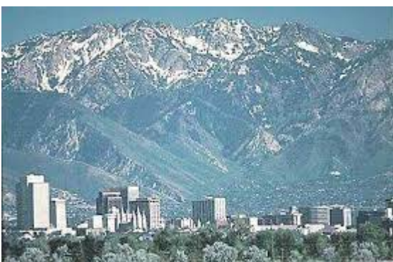
The city of Denver in the Rocky Mountains

COMPASS DIRECTIONS: The 8 main directions on a compass are - N, NE, E, SE, S, SW, W, NW.