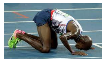
Mo Farah offering sujood