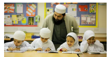
Attending Madrasah in UK