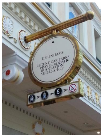
Prayer Room at Trafford Centre