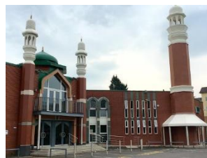
Manchester Central Mosque