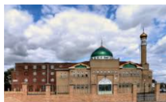
The Masjid Noor ul Islam, mosque, Bolton