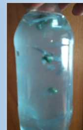
water, oil, foil

Here are some ideas for objects you can add: